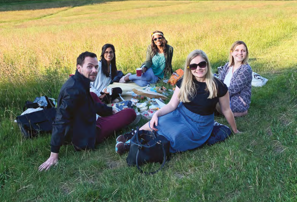
Previous: Our annual sports day hops from office to office Top: Bonding over bridge building; volunteering in Rwanda Bottom: A team that picnics together stays together