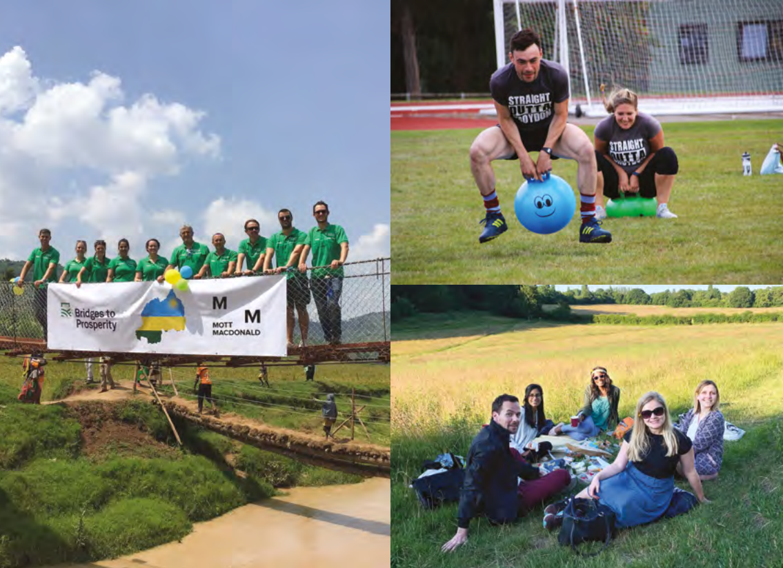
Top left: Our annual sports day hops from office to office Top right: A team that picnics together stays together Bottom: Bonding over bridge building: volunteering in Rwanda