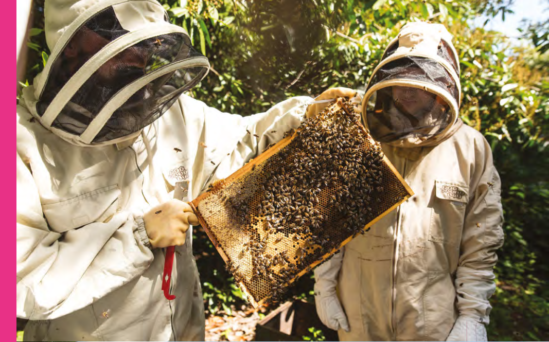
Top: One of our teams buzzing with excitement at their hive Bottom: Building equality at Pride

Click here to find out more about these schemes and what you'll need to apply. You'll also find information about our summer internships and industrial placements.