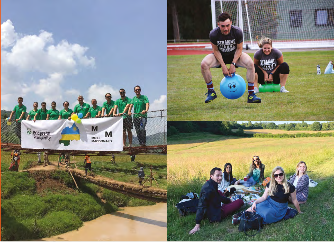
Left: Bonding over bridge building: volunteering in Rwanda Top right: Our annual sports day hops from office to office Bottom right: A team that picnics together stays together